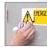
SELF WRITE LABELS